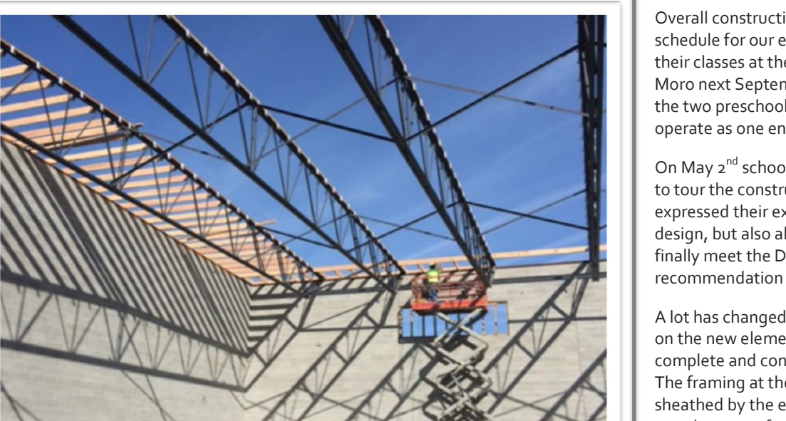
Above : The new gymnasium. Below Left : The collaboration area adjoining the PK- 3<sup>rd</sup> Grade Classrooms. Below Right : Outside the 2<sup>nd</sup> and 3<sup>rd</sup> Grade Classrooms – photo taken from the playground area.