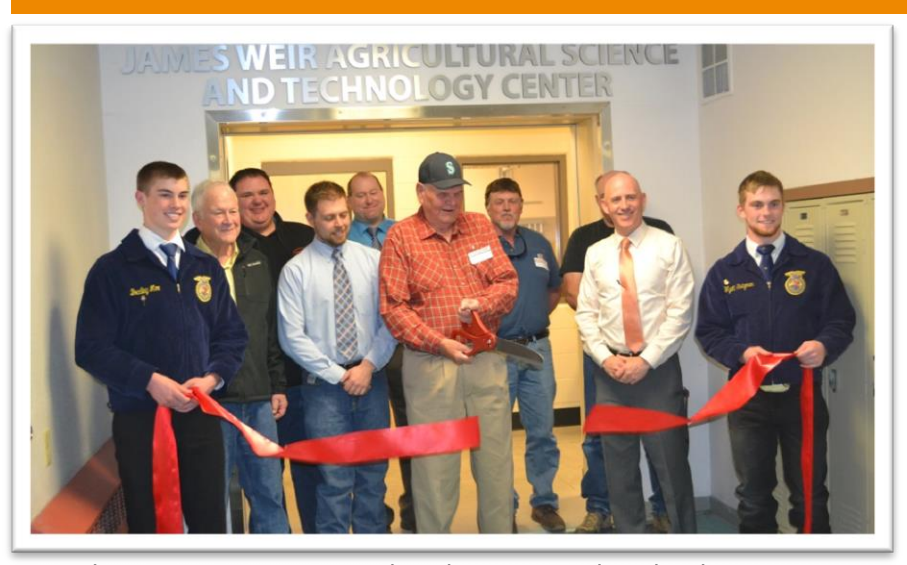
Above: James Weir Agricultural Science and Technology Center Ribbon Cutting and Dedication