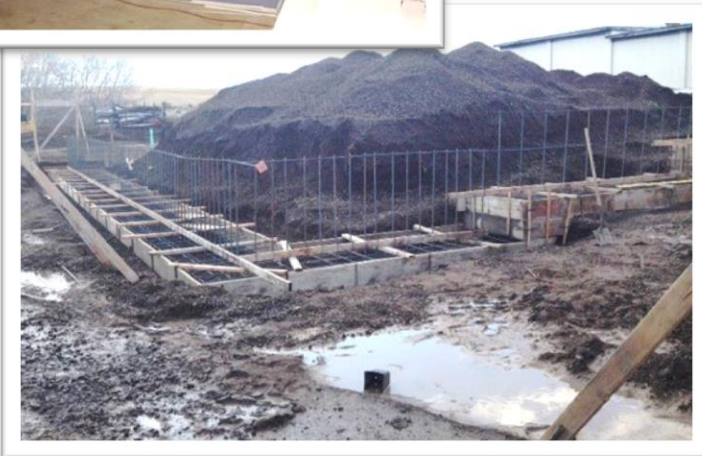
Above: Phase II Site Work